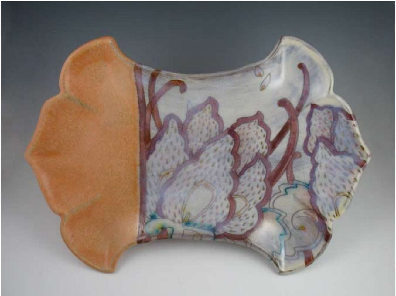
Janelle Songer "Wild Things Plate"