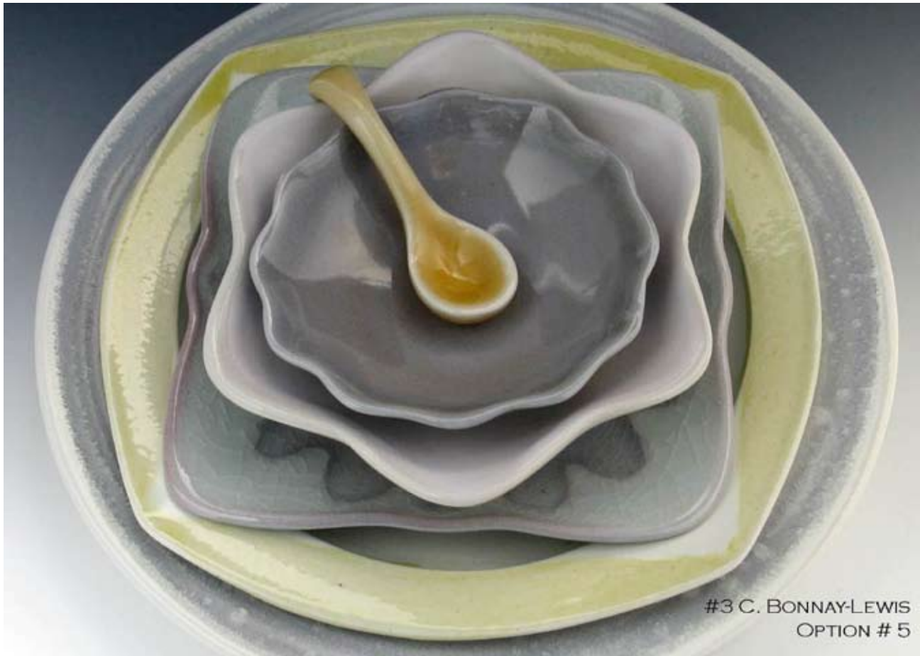
#3 C. BONNAY-LEWIS OPTION # 5