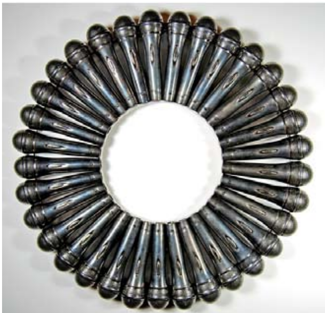
Russ Orlando "Talking in Circles"