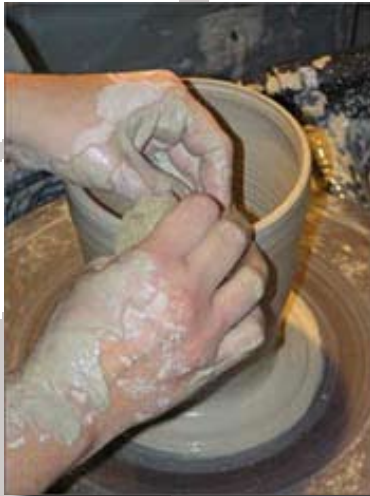
mystery pit fired vessels